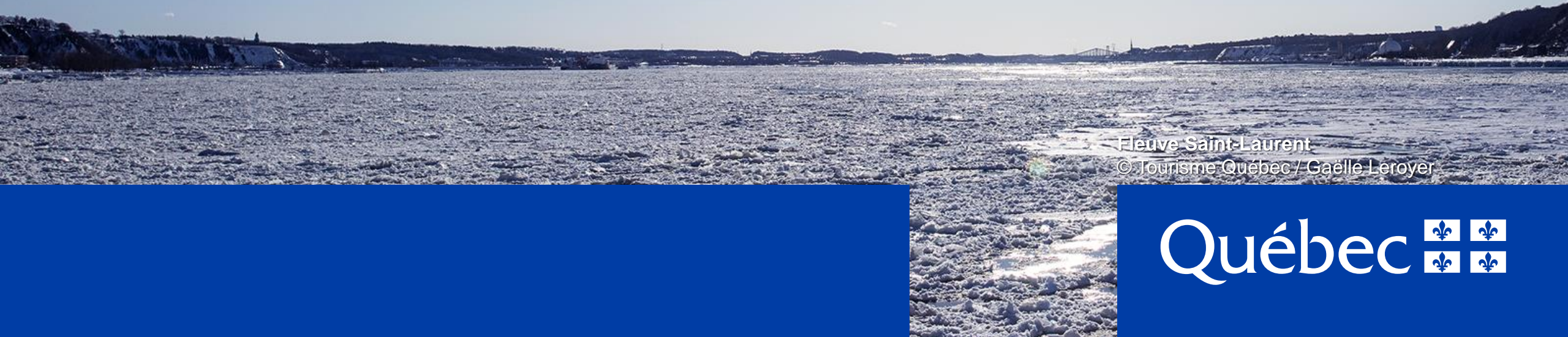
Fleuve Saint-Laurent